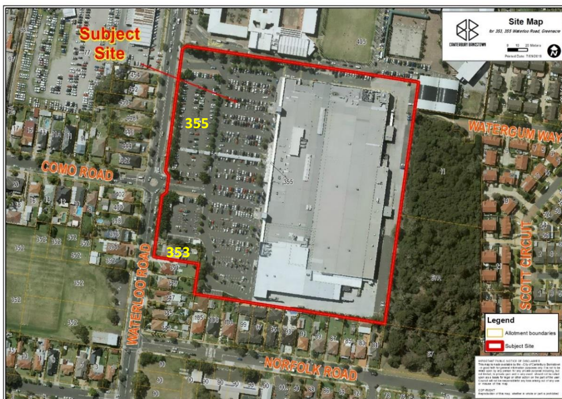
Figure 2: Aerial Image