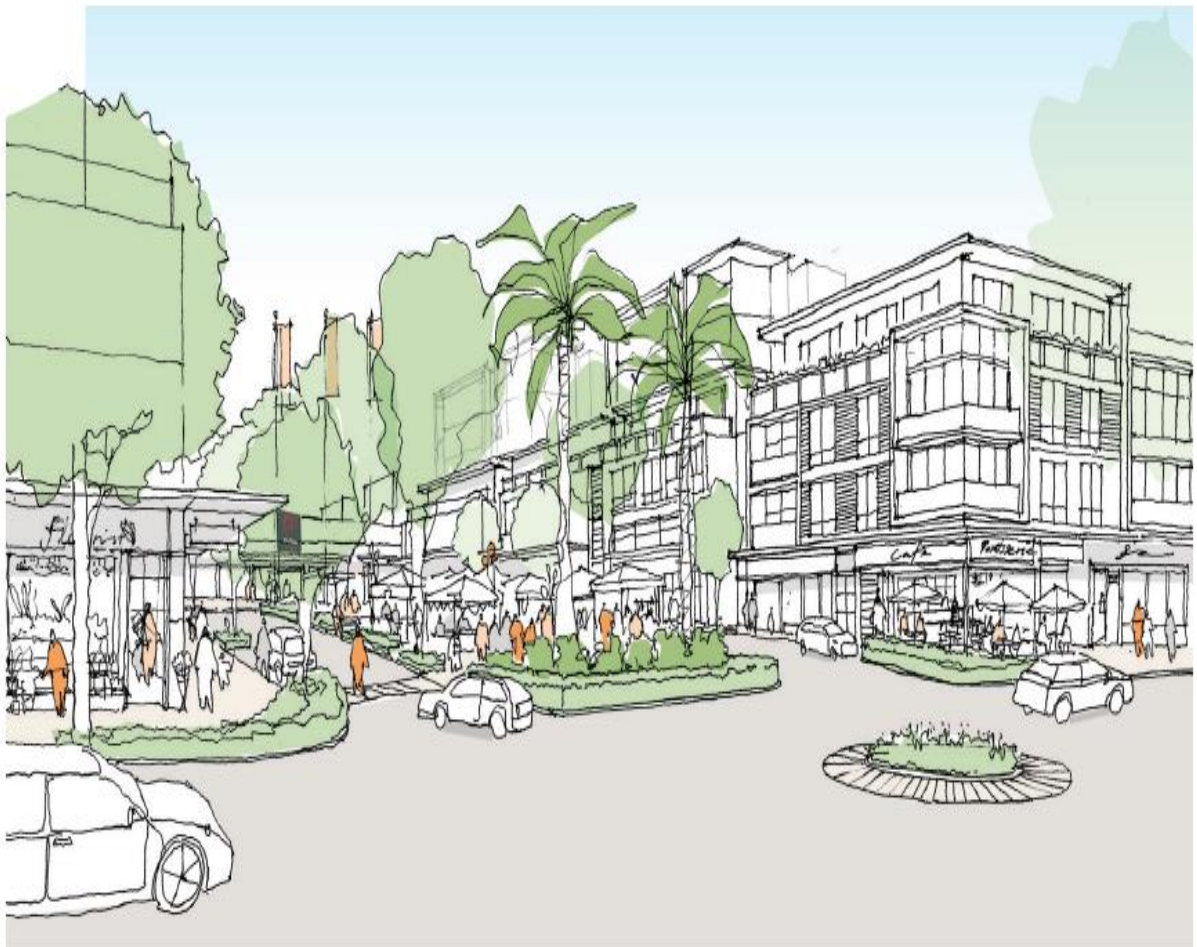
Figure 4: Application's indicative concept plan showing the new central piazza from Waterloo Road